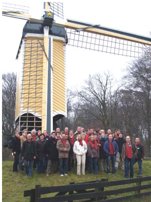
Dutch team of Agro Eco - Louis Bolk Institute

The Agro Eco - Louis Bolk Institute's headquarters are located in Driebergen, the Netherlands. Agro Eco's headquarters in Bennekom were closed upon the merger. There are two branch offices, in Kampala (Uganda) and Accra (Ghana). Activities in Eastern Europe, the Middle East and Asia are increasing and realised together with our local partner organisations.