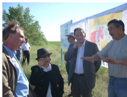
Discussing training sessions in organic farming

The project is implemented in close cooperation with the Foundation for Integration of Ecological Culture (FIEC) from Kazakhstan and is financed by EuropeAid.