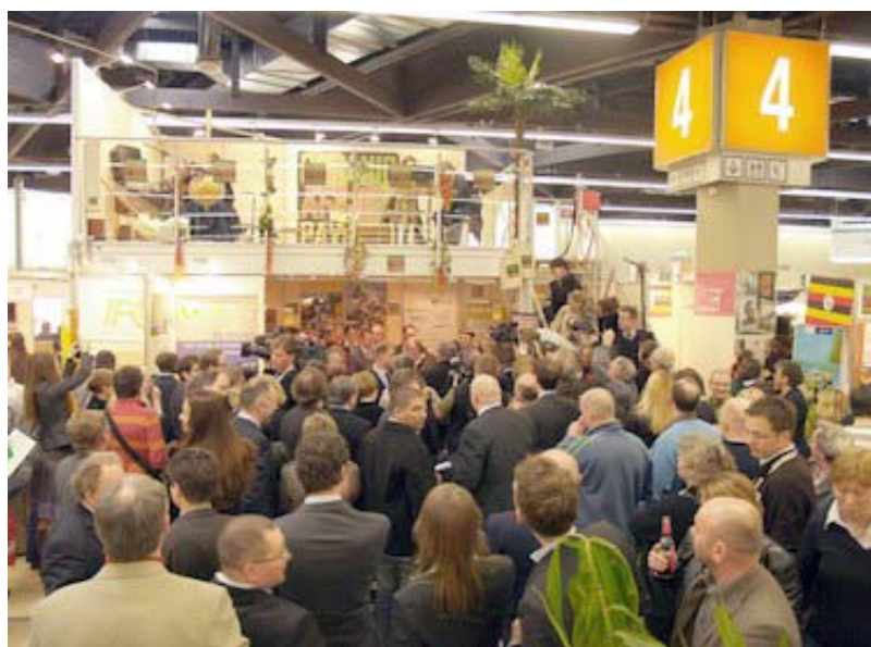
The African Pavilion at BioFach attracted many visitors

2008. It was a big success and one of the highlights of the organic fair. The Africa Pavilion was initiated to give Africa a more powerful image and position as organic supplier. In addition, it served to assist companies in their sales as well as to introduce starting exporters to the global markets.