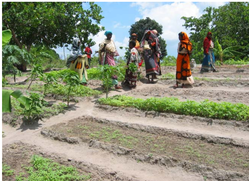
African women in vegetable garden

Other projects in Eastern Africa focused on value chain development, certification and quality management.