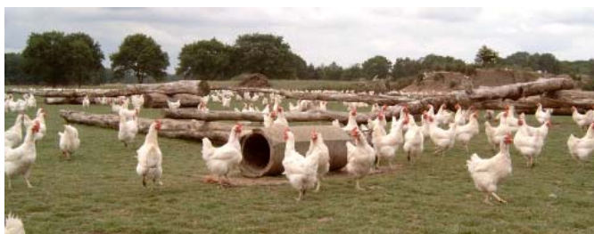
A poultry outdoor run in the Netherlands

Poultry: designing the outdoor run The outdoor run is an important aspect of organic and free range poultry. The aim of this project, which was implemented in the Netherlands, was to develop an outdoor run that promotes animal health and welfare but does not harm the environment or promote the spreading of diseases. Four demonstration farms were selected on the basis of their innovative outdoor run systems. Organic and free range poultry farmers improved their runs based on group discussions, excursions and visits to demonstration farms. During the project, research was done on the effect of outdoor runs on nutrient leaching and the relation between outdoor runs and animal health. The results of this research were discussed in the farmers groups. Project experiences have been included in a practical guide for farmers to improve the design and operation of their outdoor runs.